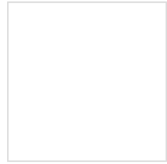
Farm to Ballet is Bringing Dance Lovers to Farm Fields